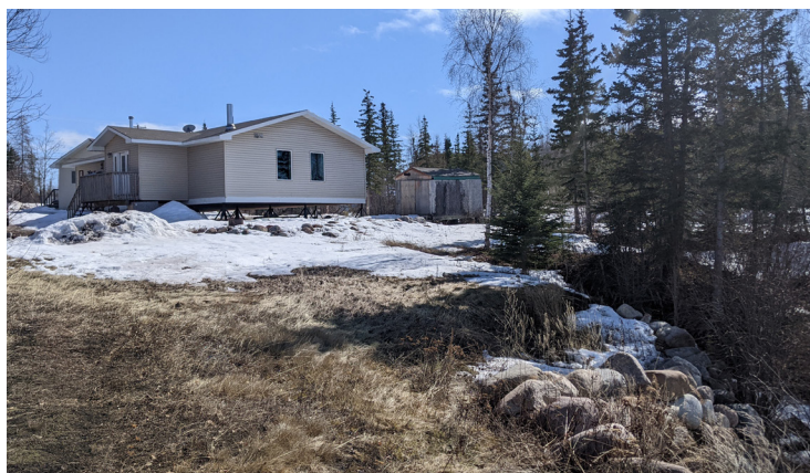
Erosion of the riverbank along the Mackenzie River is creeping closer to homes and buildings. (2023).