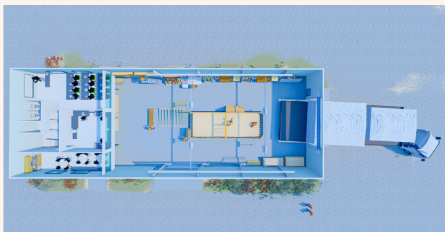
Renderings of a new Construction Centre, from Taylor Architecture Group