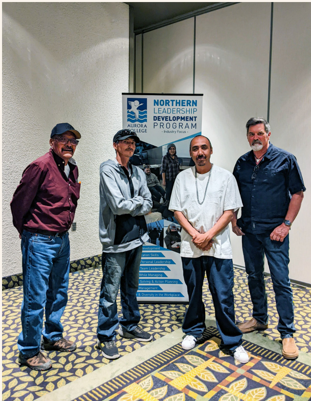
Northern Leadership Development Program graduation ceremony, spring 2023.

Goal 4 outlines the commitment to prioritize local hiring and invest in staff capacity building, through training and mentorship opportunities. It also outlines the importance of providing staff, client, and community members with regular opportunities for reflection and discussion about existing programs. This feedback can then be used to inform improvements in activities.