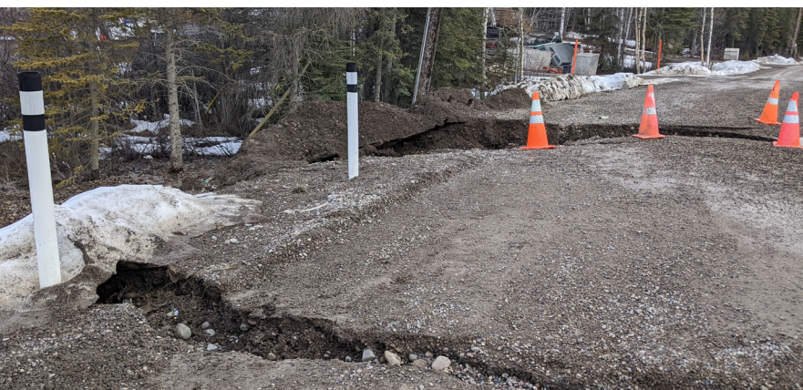
A washout in a road in Fort Good Hope during the spring thaw, 2023.

TODAY, KGHS'S WORK IS GUIDED BY FIVE OVERARCHING GOALS AS OUTLINED IN OUR STRATEGIC PLAN.