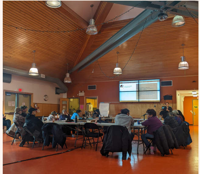
Fort Good Hope Housing Forum, January 2023